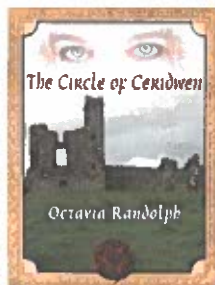
"The Circle of Ceridwen"